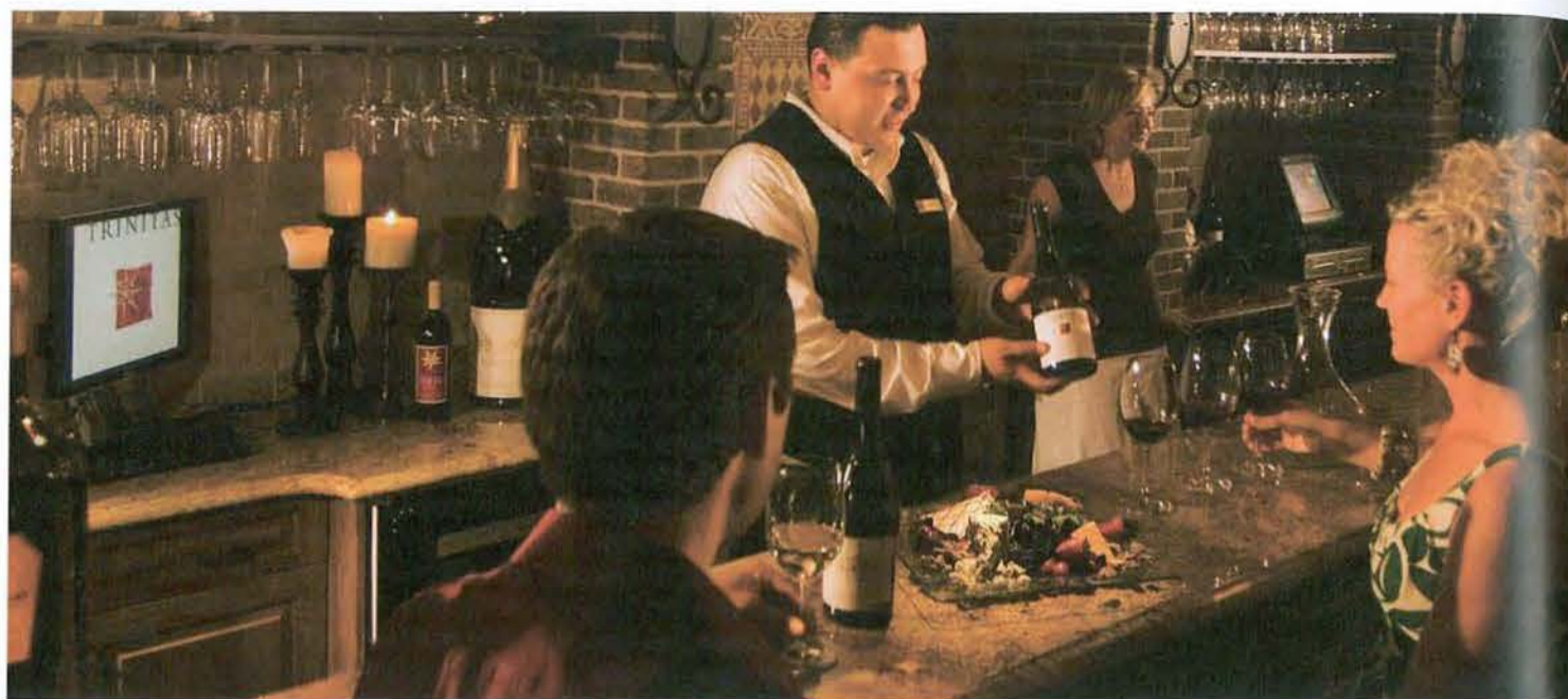
Guests sample the wine at the Estate Wine Bar at Meritage Resort.

"I have always been a firm believer that one must take advantage of what is organically indigenous to the area in which one lives and operates out of."