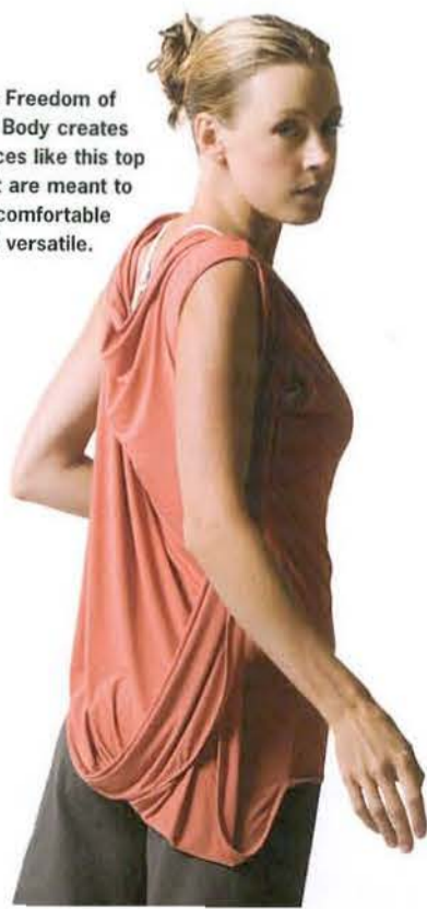
Tao Freedom of the Body creates pieces like this top that are meant to be comfortable and versatile.

that are good for the skin and the planet with designs that multitask, these and other spa-centric clothing lines allow clients to extend the spa lifestyle into what they wear.